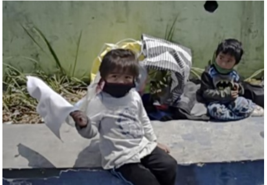
Children signalling they need food.

The Obras Sociales organization was forced to layoff 40% of its staff. With the closing of the border to all non-essential travel, visiting medical teams cancelled their missions for the year. To maintain their most skilled staff so that there will be a surgical program when teams are again able to travel to Guatemala, the hospital has redeployed many of them to work at the Virgen del Socorro facility caring for the residential patients. With the lack of cash flow provided by visiting teams, the organization is struggling to pay their staff and purchase essential supplies.