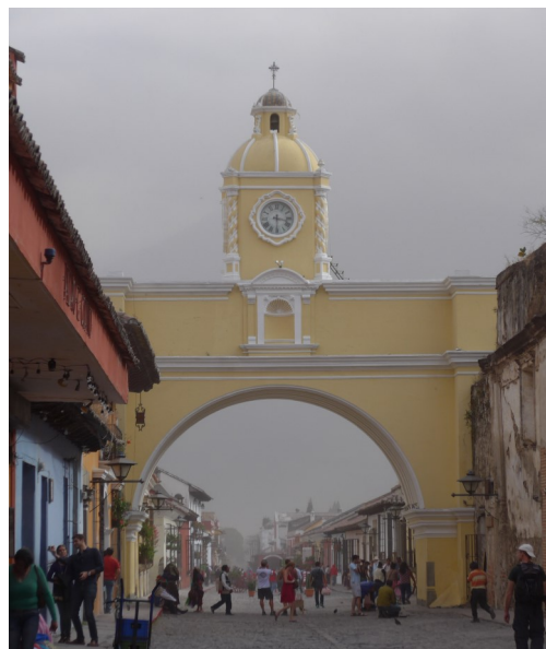
Arch in the ash fallout from Fuego

Feb. 7 th created a large cloud of fine ash that settled on Antigua and closed the