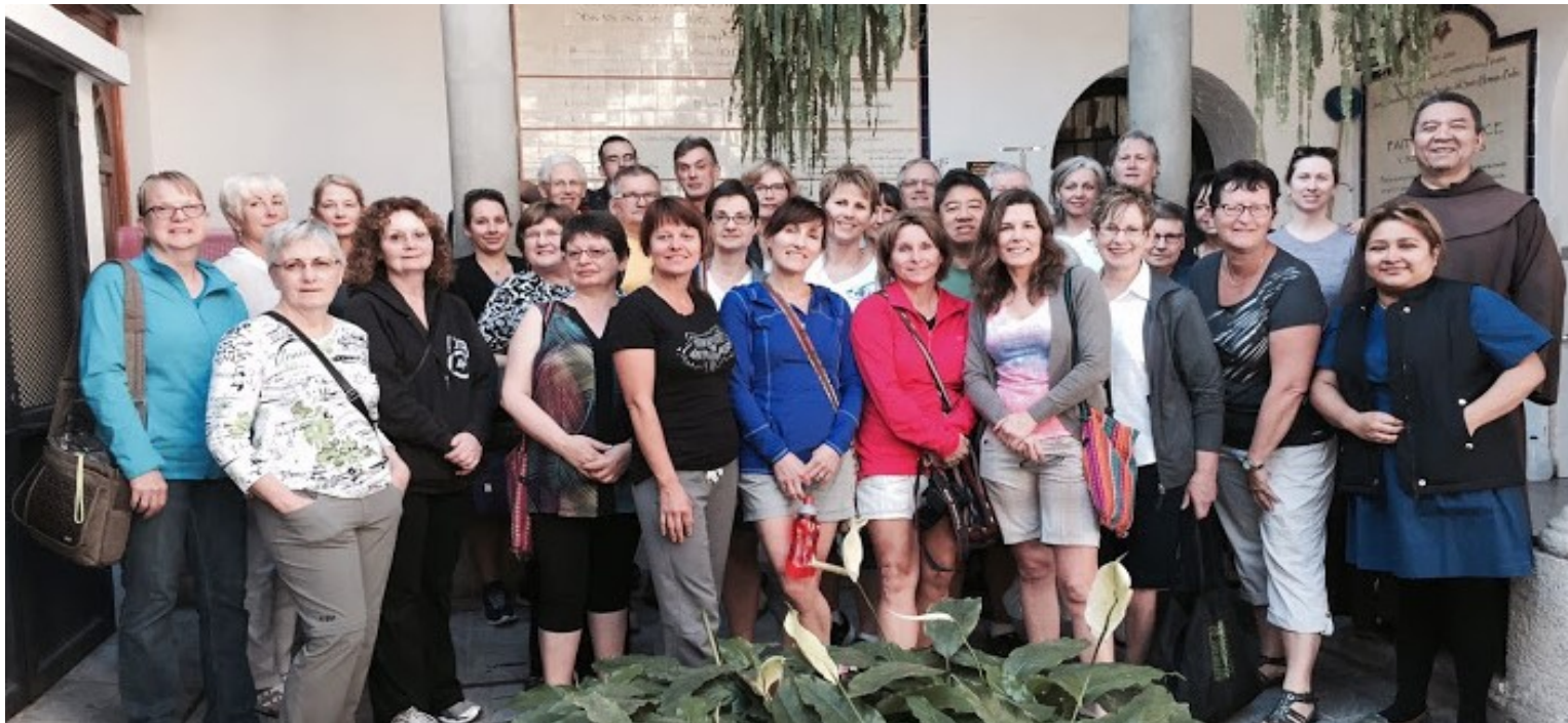
Medicos-en-Accion Antigua: Team 2015!

highway connection to Guatemala City as well as the airport for several hours. Some team members experienced minor respiratory symptoms for a couple of days.