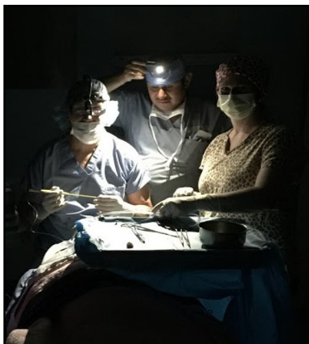
Work carried on with the assistance of headlamps after a power failure.

were held during the afternoon of the first operative week and identified more patients requiring surgical procedures, which were then scheduled and completed during the team's time at the hospital.