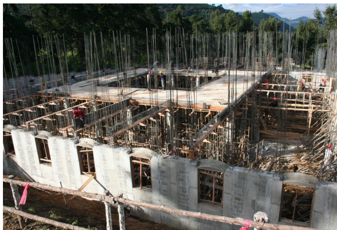
Photo left: Construction of the new residential facility is on schedule for a late 2015 opening.

The Obras Sociales is currently building Virgen del Socorro , a permanent home for the children and adults with special needs currently living in the hospital complex. Once construction of this facility is completed and everyone relocated (in late 2015), a project to construct three new operating rooms and support facilities will begin at the hospital.