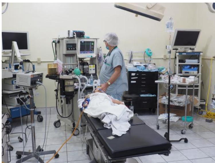
One of the two ORs at Hospital Shalom.

Medicos-en-Accion is a registered charity in Canada.