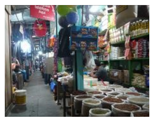
Visiting Antigua's "scary" market is always a shopping adventure!